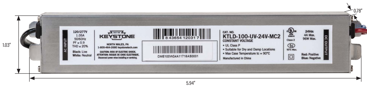
24 Volt Pocket Driver

Just 1/4 the size of a conventional LED driver!