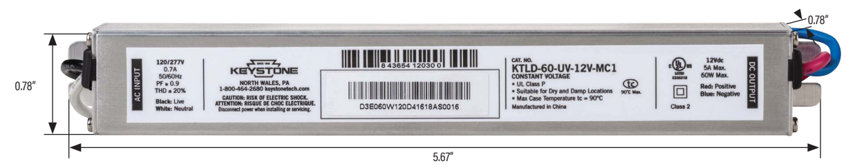
12 Volt Pocket Driver