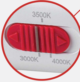
Color Select Switch